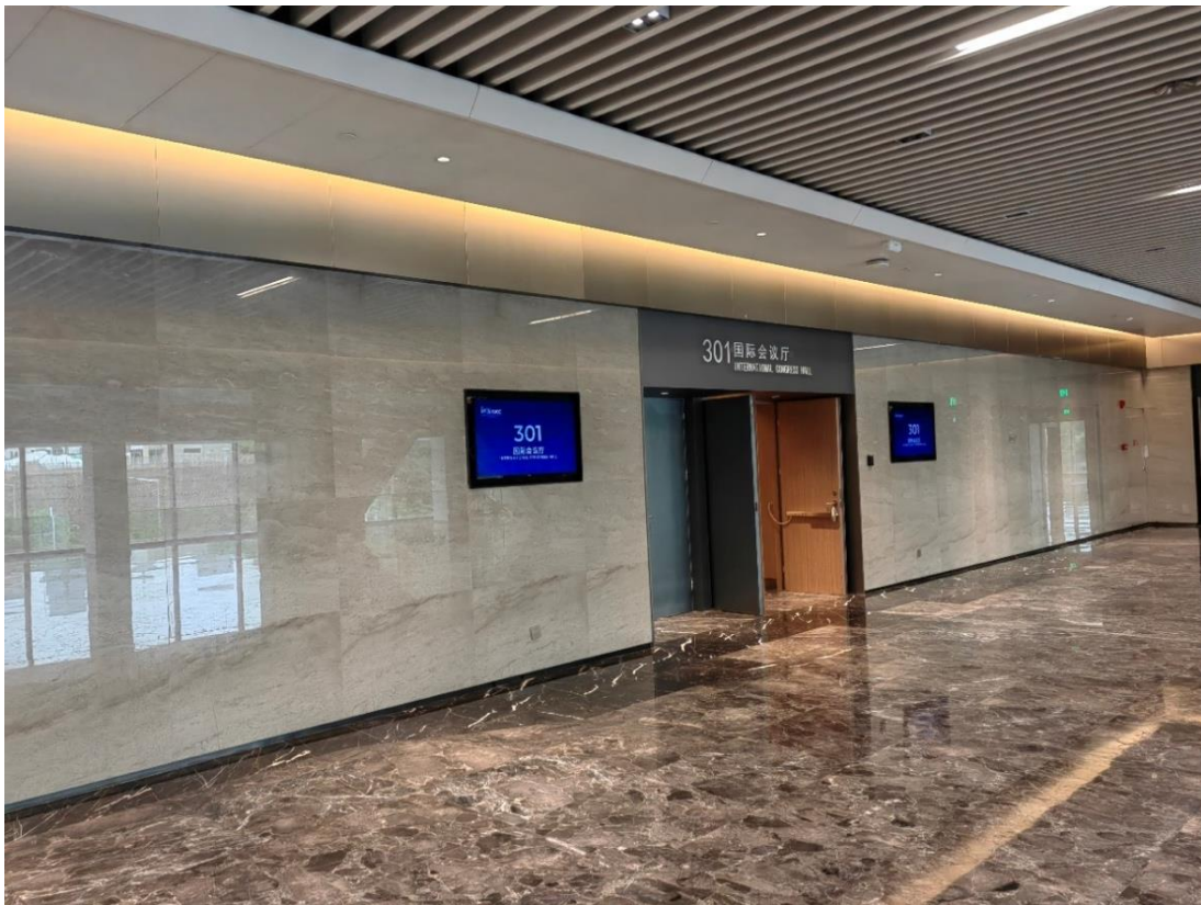
Floor 3 of the Conference Center (Enterprise Display)