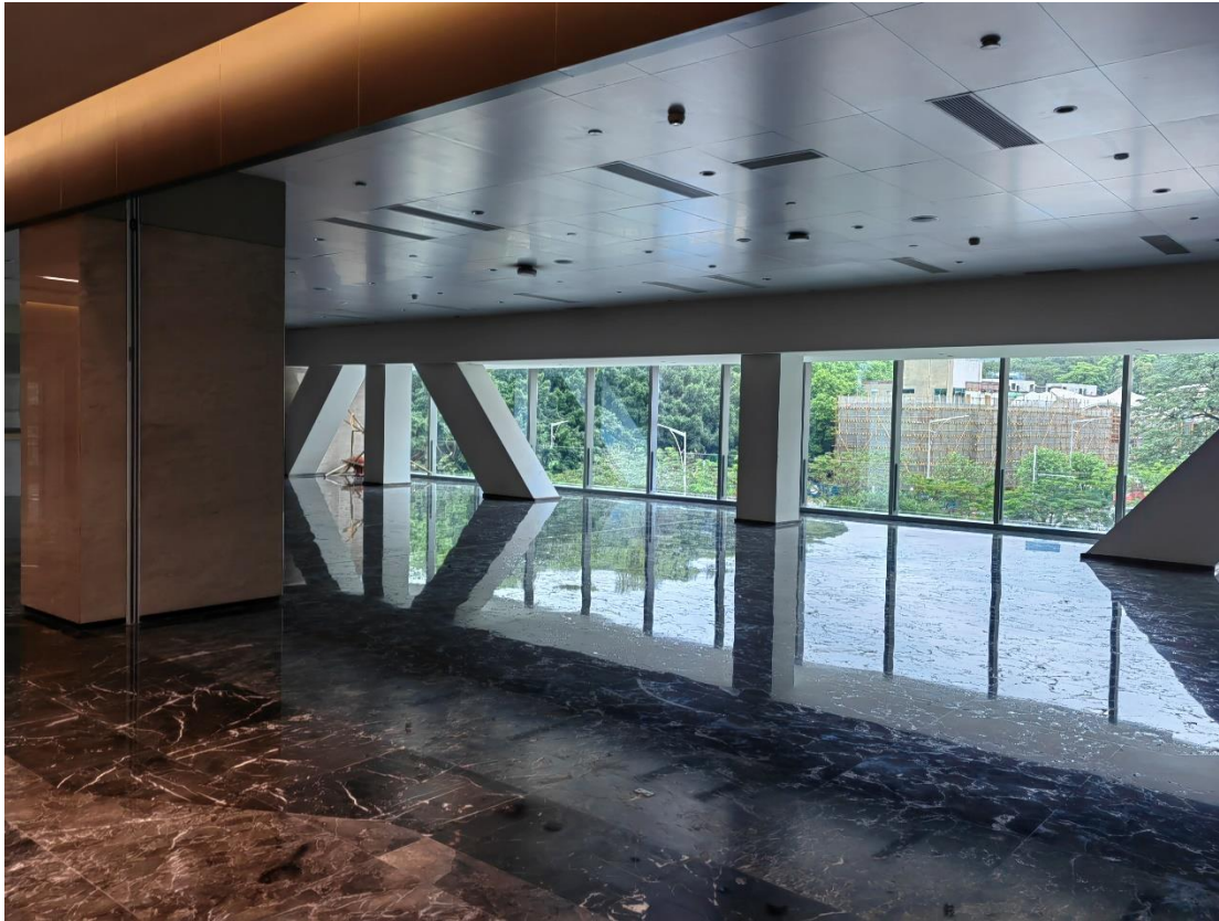
Floor 3 of the Conference Center (Conference Report Tea Break Area on Aug. 9 Morning)