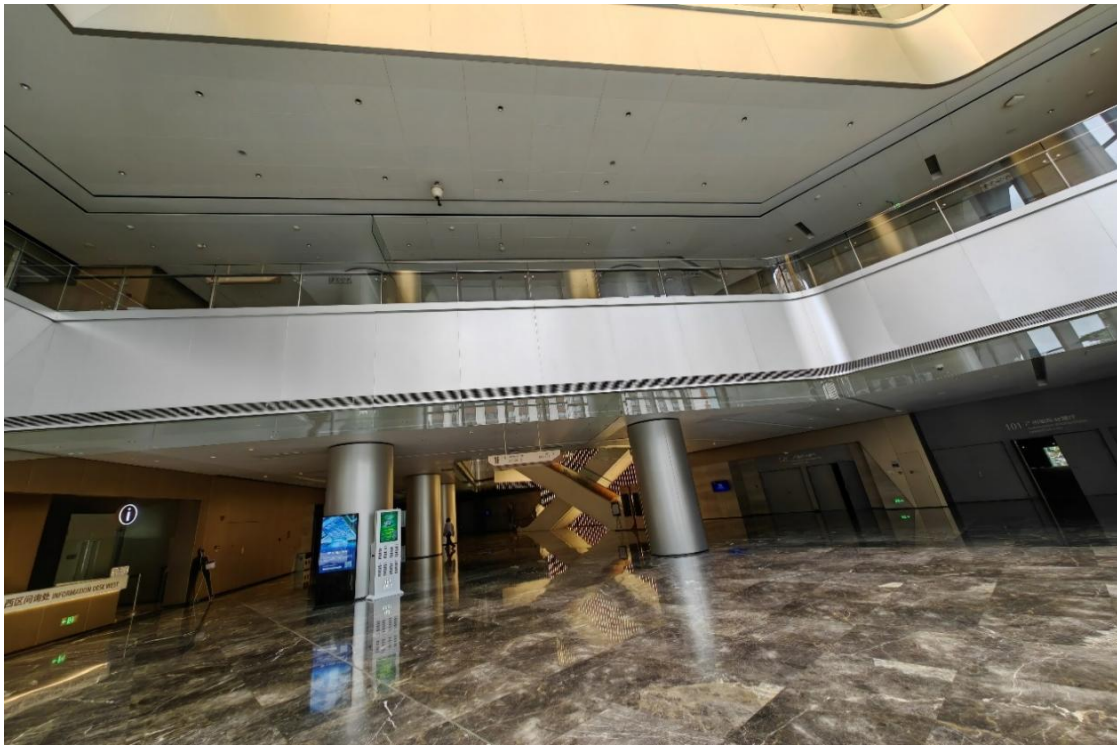
Floor 1 of the Conference Center (Primary Sponsor Display)